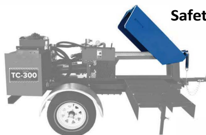
Safety Cover Kit #6171