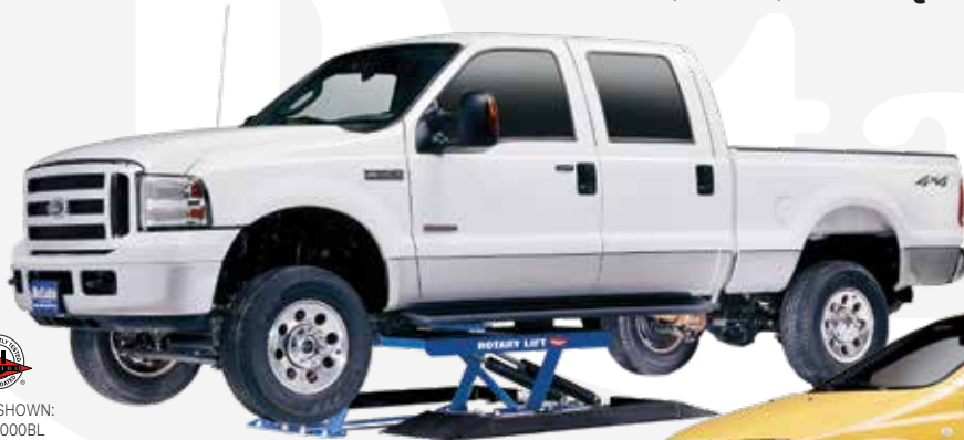
MODEL SHOWN: VLXS1000BL

7,000 - 10,000 lbs. / QUICK SERVICE LIFTS