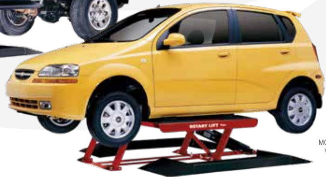
MODEL SHOWN: VLXS7000BL